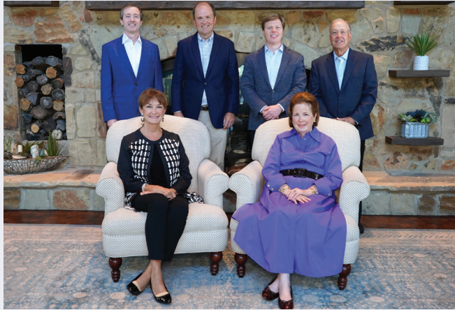
PHOTO OF 2021 GOVERNING BOARD